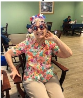
Pat loves to show off!

Thank you everyone for making our Independence Day a entertaining and special celebration.