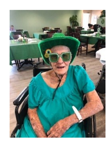
Happy strutting her stuff at the St. Patty's Day Party