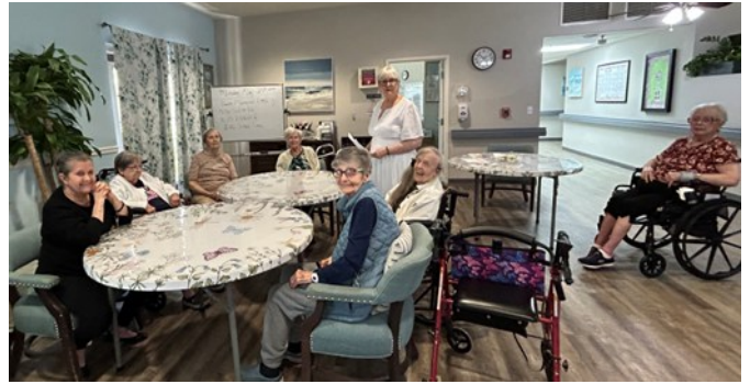
Residents gathering for the resident council meeting held every third Thursday @ 10:30 am.

At the next Resident Council meeting June 18h, we will be electing a new secretary for the resident Council, as this position is vacant.