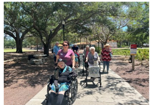
The whole gang on the walking trail, enjoying the beautiful weather!